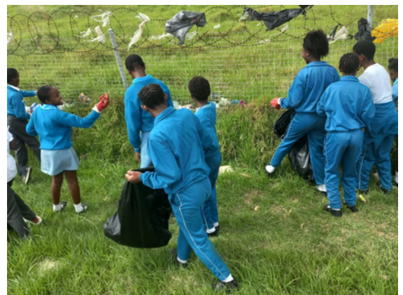
Nomzamo HS and Christmas Tinto PS Learners on Cleanup Day -----