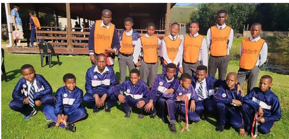
ACJ Phakade Primary School's Prefect Camp