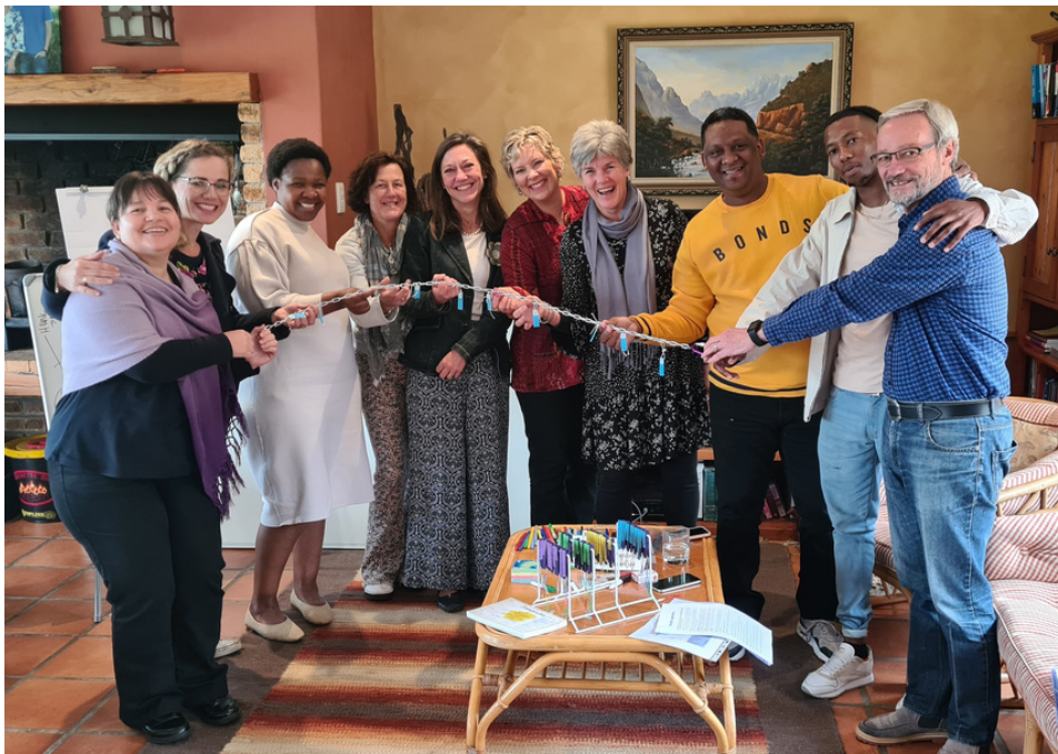
SSCC Team Building - discovering our Strengths

Theodore Roosevelt said: "In any moment of decision, the best thing you can do is the right thing, the next best thing is the wrong thing, and the worst thing you can do is nothing." I would like to add the following to that: with clear God-given goals and the resilience to continue", SSCC has proven itself in this regard.