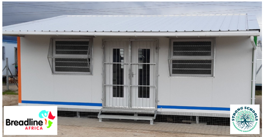
The school's newly built library by Breadline Africa who says: "Every child has the capacity to do something phenomenal with his or her life."