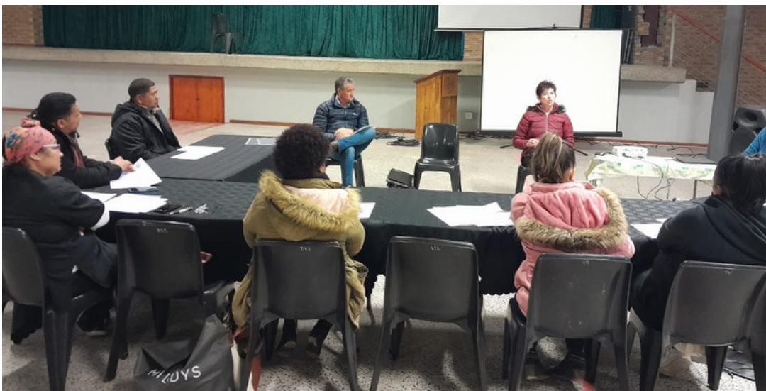
SGB session at Dr. GJ Joubert Primary School

The well-being of learners, educators and parents and the lack thereof is a huge need that Covid-19 highlighted even more. After sharing the heartbeat and four focal areas (Spiritual, Psychological, Life Skills, Physical) with our schools, we launched the Well-being Hubs in May 2023. It was well-received by our School Governing Bodies, the City of Cape Town and the corporate sector, who already started supporting the suggested Well-being projects and programmes. We conducted sessions with the school SGB's and identified a WBH champion in every school who supports the facilitators and processes in the schools.