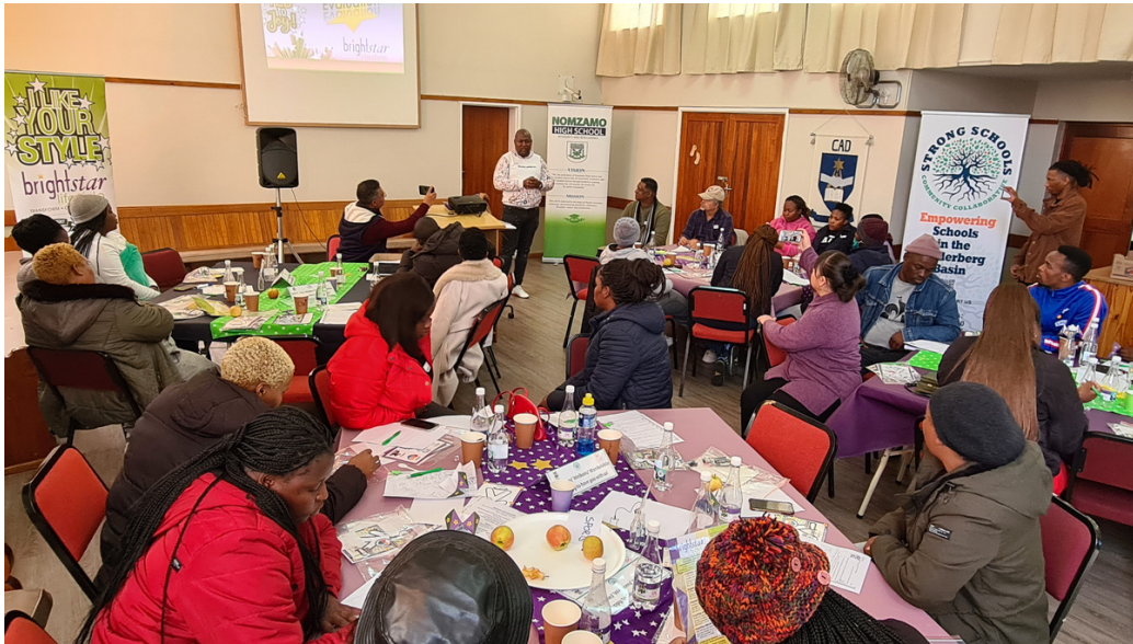
Nomzamo High School BrightStar Team Building Workshop for Teachers