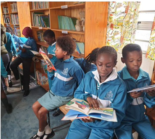
Christmas Tinto Primary School Learners in current Library

“ | "Once you learn to read, you will be forever free." | | - Frederick Douglass | ”